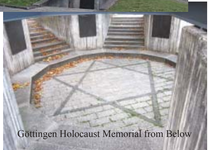
Göttingen Holocaust Memorial from Below