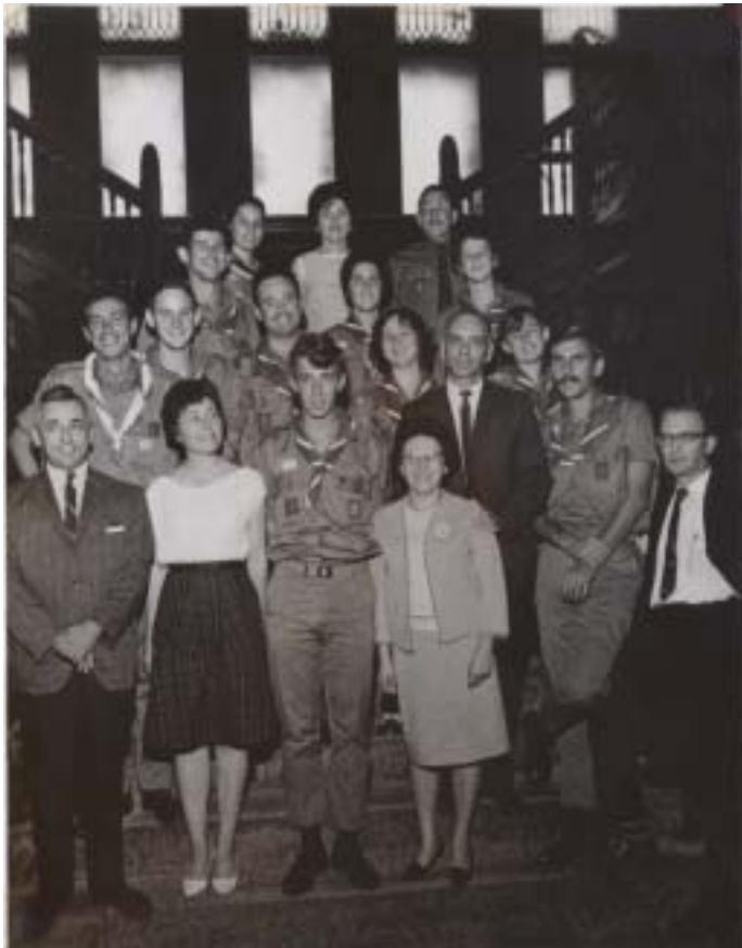
Dialogue editor apologizes for forgetting this entry last month

Dear Temple Sinai members: Thank you for your support during a difficult week for us. We appreciate all of the cards and well wishes we have received and know all of your prayers helped. We are grateful to be part of such a warm and caring community.