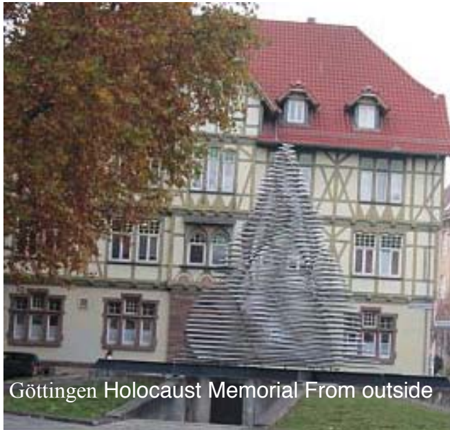
Göttingen Holocaust Memorial From outside