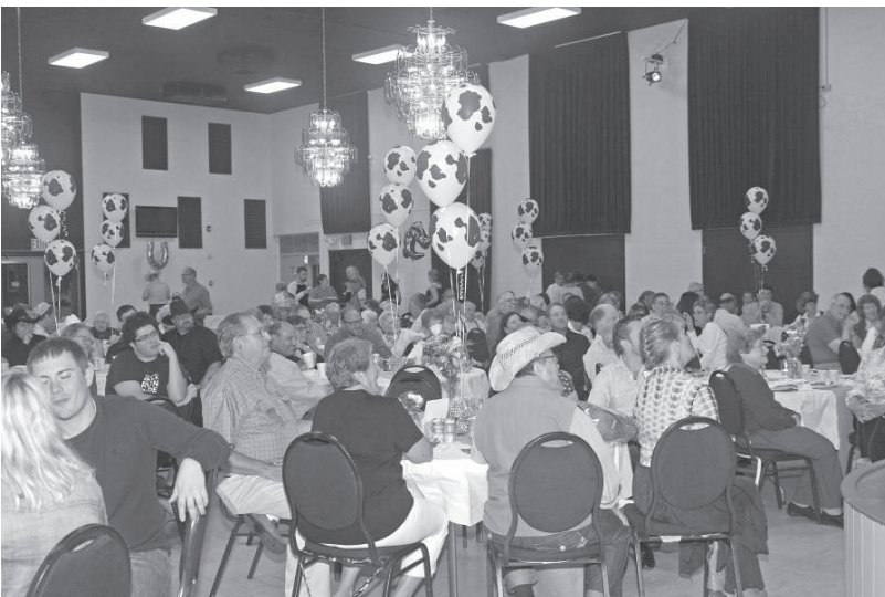
The shindig was a big success with over 150 people in attendance!