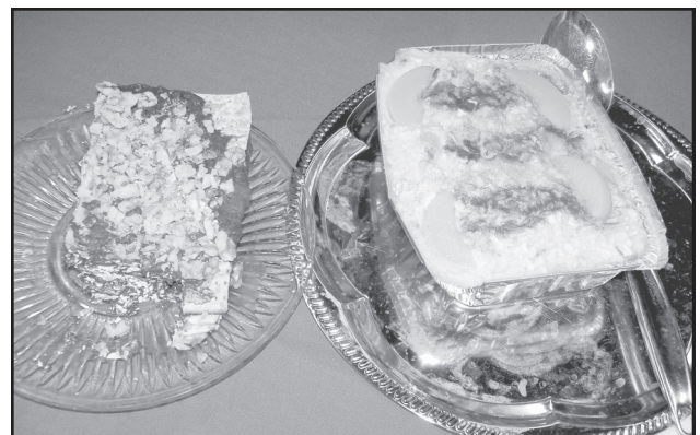
Two of the finished dishes: the 7-Layer Matzo Cake (left) and the Peach Pudding.